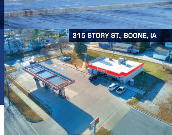
315 STORY ST., BOONE, IA