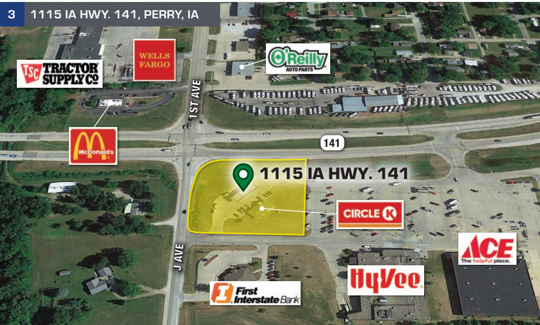
3 1115 IA HWY. 141, PERRY, IA