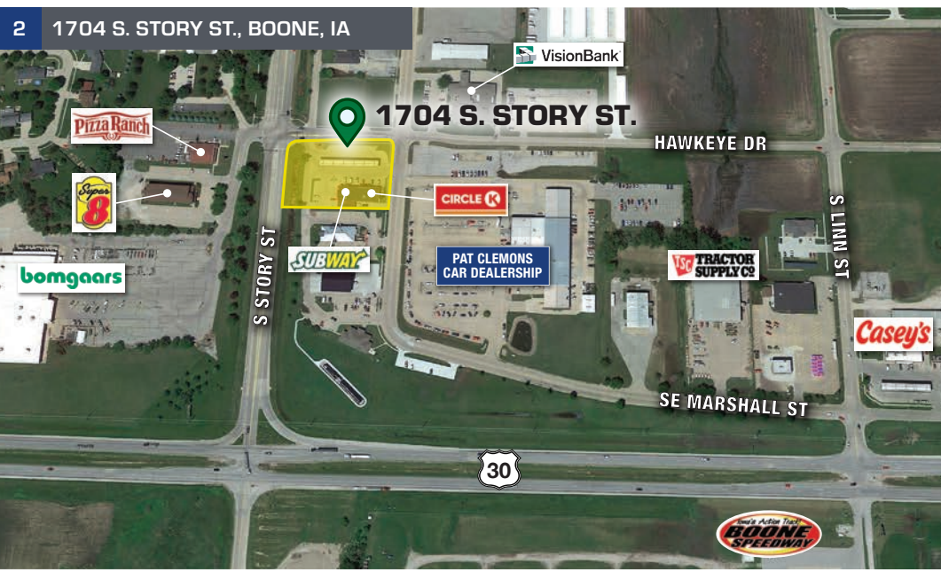
2 1704 S. STORY ST., BOONE, IA