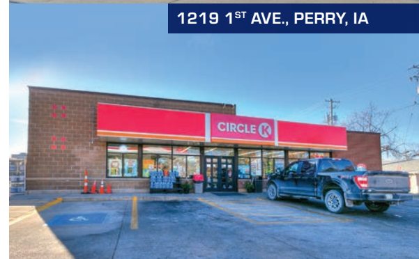
1219 1 ST AVE., PERRY, IA