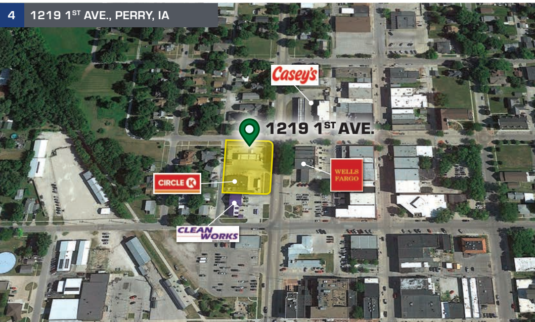
4 1219 1 ST AVE., PERRY, IA