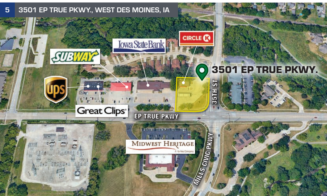
5 3501 EP TRUE PKWY., WEST DES MOINES, IA