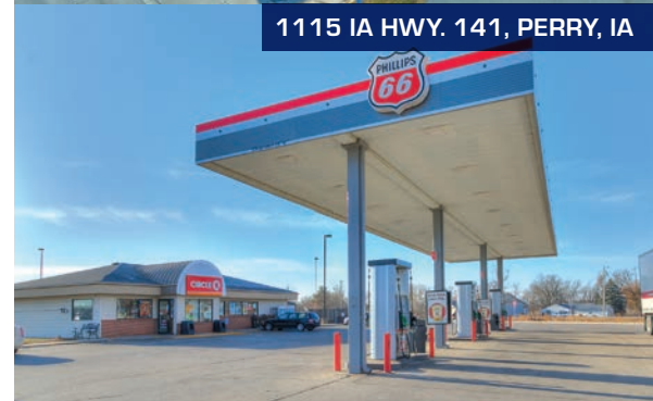
1115 IA HWY. 141, PERRY, IA